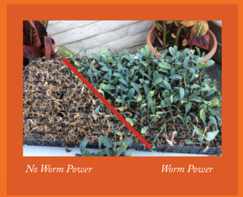
Drought Tolerance Trial