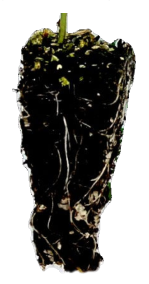
Figure 1. Root comparison of untreated seedling (left) and WPLE treated seedling (right).

Weekly applications of 8 oz of WPLE were applied with the current foliar system in a commercial nursery to tomato, pepper, leek, and broccoli seedlings. Previous issues of salinity and high nitrates in the water caused poor root development resulting in delayed shipping of the transplants. The picture of the seedling roots (below) shows a root comparison between a control and a seedling that received applications of WPLE. The application of WPLE increased root development by over 50%.