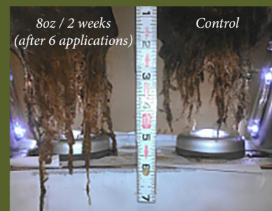
Oak Park Country Club #8 Green