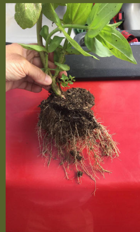
Root development of Zinnias (left) and a garden of Zinnias (right)