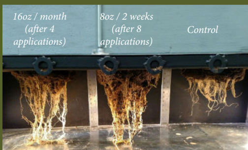
Oak Hill Country Club West Course Fairway

Through ten years of trials and university research with top leading land grant university's, Worm Power has consistently been shown to produce stronger, healthier and more vigorous plants.