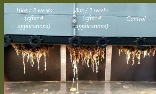
Oak Hill Country Club Practice Green