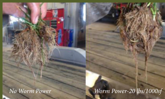
Turf plugs from new seeding

Worm Power will enhance plant vigor and improve stress tolerance, for turf that will thrive throughout the season.